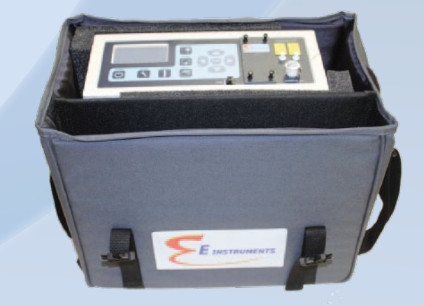
Weight: 11 lbs. (5 kg)