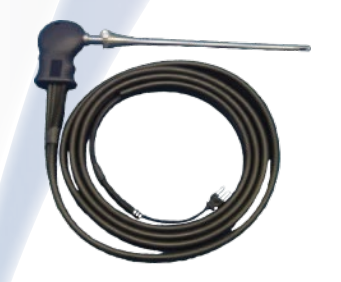
Table C - Sampling Probes and Hoses